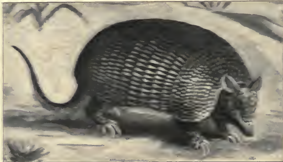
FIG. IV. TATU NOVEMCINCTUM. NINE-BANDED ARMADILLO.

Cachicamus McMurt., G. Cuv. Anim. Kingd., 1, 1831, p. 163.